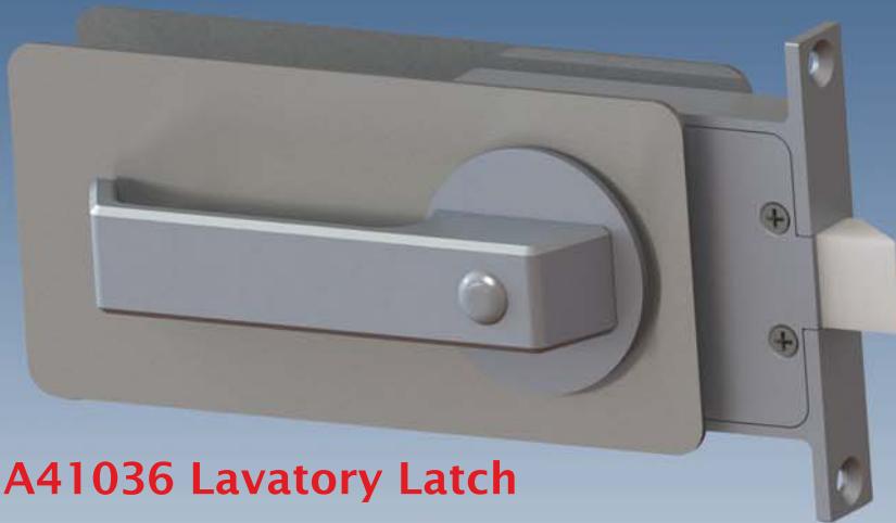
A41036 Lavatory Latch