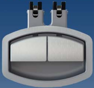
A23909-2 Latch Assembly Double Paddle Double Bolt