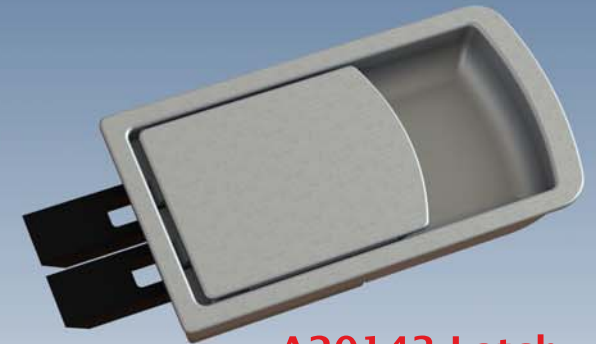
A20143 Latch with Double Bolts