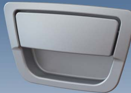
A39500 Drawer Latch