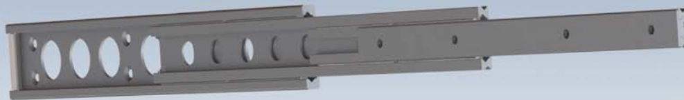
A5385-0101 Frictionless Slide